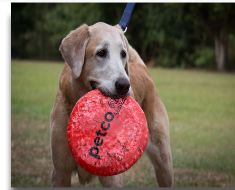
Brewski - 9