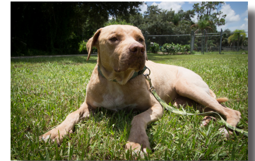
Galaxy - 14