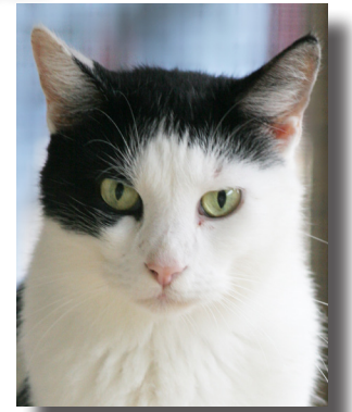
Mambo - 11

With nearly 450 residents on any given day, you know that a reasonable percentage of them may be older dogs and cats. We consider those animals that are six years of age or older our, "senior residents". But did you know that these older residents make fantastic pets? That's right! You don't need to adopt a puppy or kitten to find your perfect companion. There are many advantages to adopting a slightly older pet. For one thing, an older pet is more likely to respect your belongings. You also know exactly what you're getting in terms of size and weight. Older pets are often calmer, and easier to just kick back and relax with. Older pets CAN learn new tricks, and are perfectly trainable with a little effort and commitment on your part. But perhaps most important of all, senior pets are forever grateful. Somehow, older pets seem to know you gave them a home when no one else would. Many new owners form a close bond very quickly with their senior dog or cat, because the pet shows them a level of attention and devotion that is unique to older adopted animals. Please... Consider one of our senior residents today!