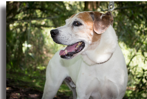
Frasier - 12

With nearly 450 residents on any given day, you know that a reasonable percentage of them may be older dogs and cats. We consider those animals that are six years of age or older our, "senior residents". But did you know that these older residents make fantastic pets? That's right! You don't need to adopt a puppy or kitten to find your perfect companion. There are many advantages to adopting a slightly older pet. For one thing, an older pet is more likely to respect your belongings. You also know exactly what you're getting in terms of size and weight. Older pets are often calmer, and easier to just kick back and relax with. Older pets CAN learn new tricks, and are perfectly trainable with a little effort and commitment on your part. But perhaps most important of all, senior pets are forever grateful. Somehow, older pets seem to know you gave them a home when no one else would. Many new owners form a close bond very quickly with their senior dog or cat, because the pet shows them a level of attention and devotion that is unique to older adopted animals. Please... Consider one of our senior residents today!