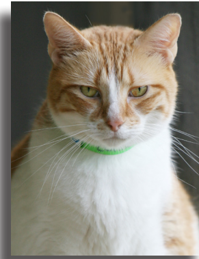
Collins - 9