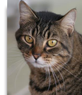
Hitch - 8