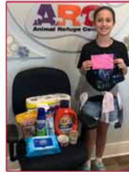
N'Evaeh collected supplies and donations.