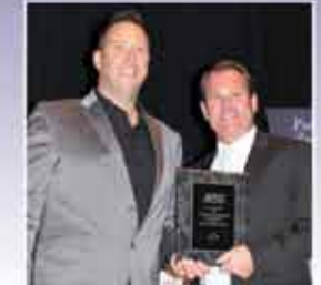
E G Contracting Company

THANKS SO MUCH TO OUR GENEROUS SPONSORS & DONORS